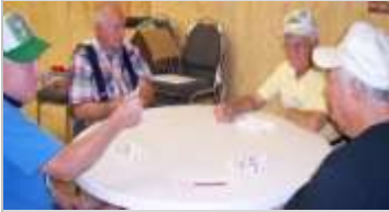
Playing 42 at the Spring Campventure

"One may also find that the national organizations have state organizations like the Texas State Association of the FCRV –