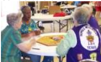
Game of Joker's Wild

The Retirees of Texas, Chapter 89, is hosting the Fall Campventure. It will be held at Red Oak RV Ranch just outside of Hempstead, Texas. The dates are November 25-29, 2009. Please find the registration form in the Blue Bonnet Banner and follow the instructions to register